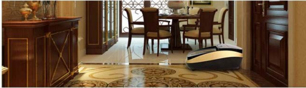
For home、real estate