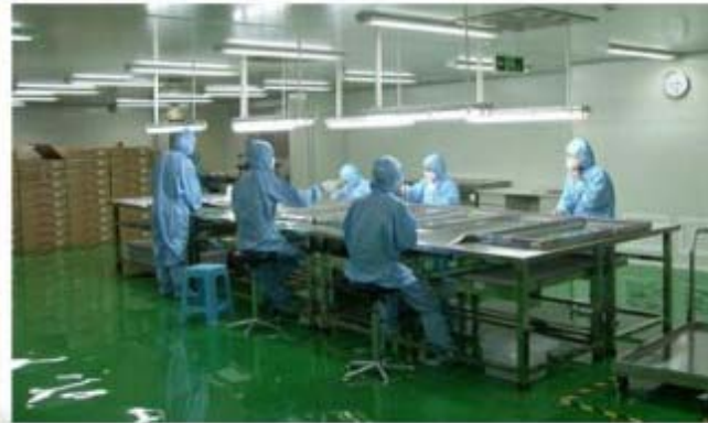
For clean room