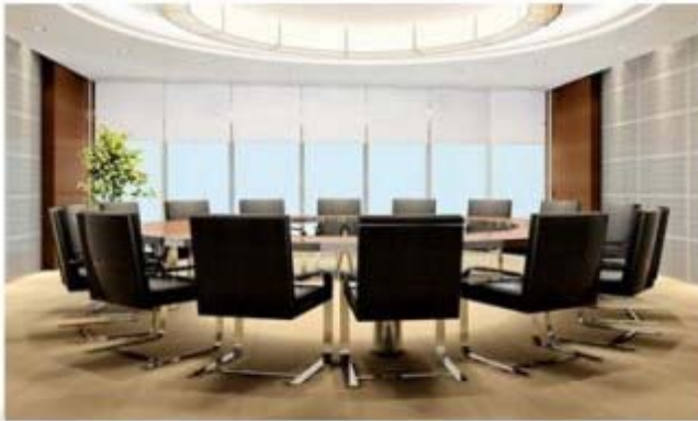
For meeting room