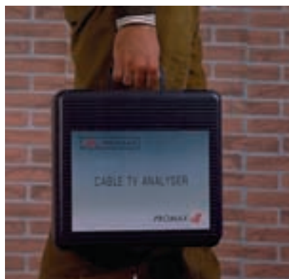
Carrying Case DC-234