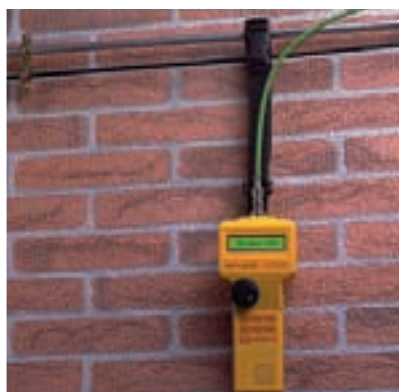
Shoulder Strap DC-286